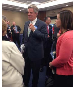
Rep. Frank Pallone (D-NJ) visits with BIAA and NASHIA.

Several organizations, including Safe States Alliance, NASHIA, and the Injury and Violence Prevention Network, sponsored a Briefing, "SURVEILLANCE: Building the Evidence to Address Prescription Drug Overdoses, Violence, and Traumatic Brain Injuries," on March 17th in the Russell Senate Office Building. The briefing focused on the vital role of data to prevent injuries and violence and to plan for TBI service delivery.