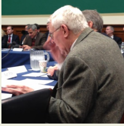
Rep. Joe Pitts (R-PA), Chair, House Subcommittee on Health, listens to the discussion.